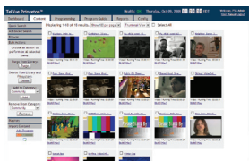
Intuitive Content Management System

The B1000 Digital Broadcaster optionally integrates with TelVue's WEBUS® Inside bulletin board and digital signage service, providing true multi-user video message board services to the important organizations in your community.